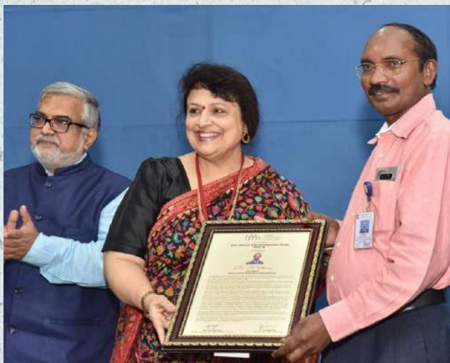
Pic 2: Chairman of ISRO, Dr. K. Sivan, receiving '2018-19 BMA Jury's Special Recognition Award'

All India Management Association (AIMA) has awarded BMA as 'Best Local Management Award' for several times since its inception. The membership of BMA comprises of Corporates, SMEs, Entrepreneurs, Self-employed professionals, Individuals and Management Institutes alike. Some of the distinguished corporate members are Tata Steel, ITC, TCS, Voltas, Wockhardt, Greaves Cotton, JSW Steel, Tata Chemicals, BASF India, The Shipping Corporation of India, Colgate Palmolive (I), BPCL, ACC, Mastek, Housing Development Finance Corporation Ltd., The Bombay Dyeing and Manufacturing Company, Godfrey Phillips India, IDFC, Lintas, Kores India, Blue Dart, Lupin, Tata Housing Development, Godavari Biorefineries, National Peroxide, J K Ansell, Citizen Credit Co-op Bank amongst others.