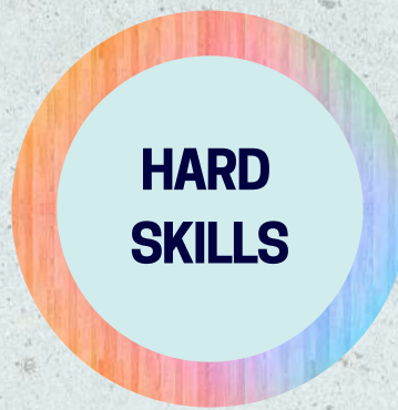
Course 2: Core Skills