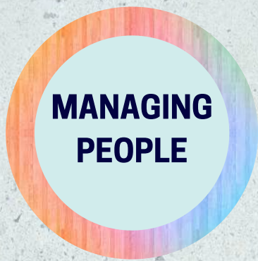
Course 1: Ikigai