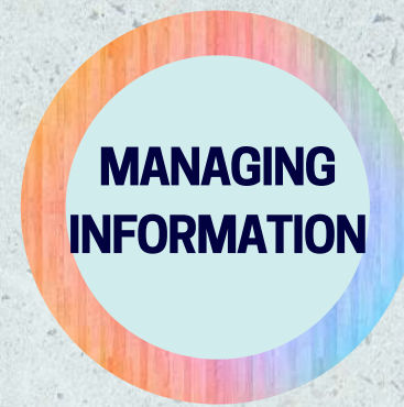
Course 3: Integrated Digitalisation