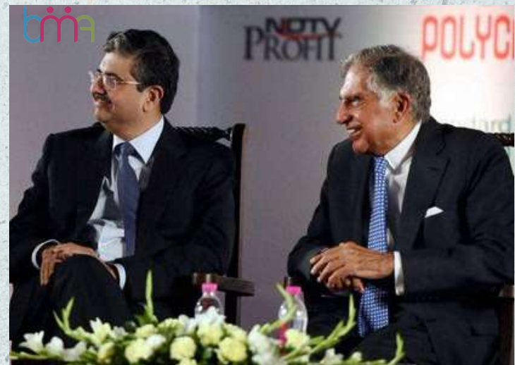
Pic 3: Mr. Uday Kotak (left) and Mr. Ratan Tata (right) at the 36th BMA Awards 2013-14