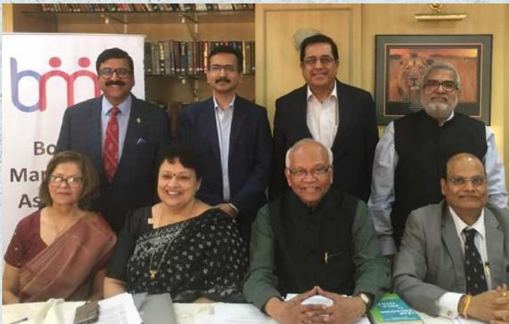
Pic 1: BMA Awards 2018-19 Jury Committee, lead by Chief Jury, Dr. Raghunath Mashelkar

Bombay Management Association (BMA) since its establishment in 1954 has pioneered efforts to help enhance managerial effectiveness and improve the standards of Business Management in India.